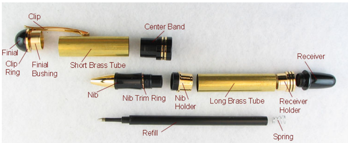
Parts Diagram for the Churchill Roller Ball and Fountain Pen

Needed: Mandrel-B Bushing-16B Drills- 31/64", 13.3mm Wood Size- 7/8" x 7/8"