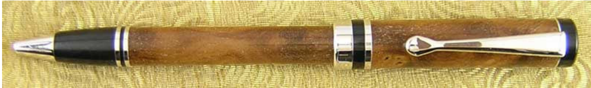
Flat Top American Pen in Sterling Silver and Russian Olive